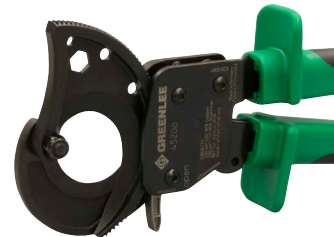
45206 Flip Top, Ratcheting Cable Cutter