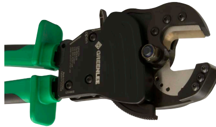
45209 Open Jaw, Ratcheting ACSR Cutter

ACSR: 336 MCM Copper: 400 MCM Aluminum: 600 MCM