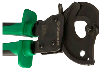
45210G Flip Top, Ratcheting ACSR Cutter

ACSR: 336 MCM Copper: 400 MCM Aluminum: 600 MCM