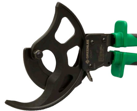
45207 Flip Top, XL Ratcheting Cable Cutter