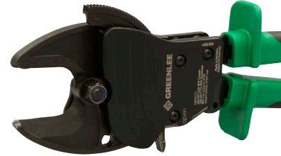
45208G Open Jaw, Ratcheting Cable Cutter