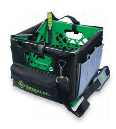
CRATE COVER TOOL ORGANIZER