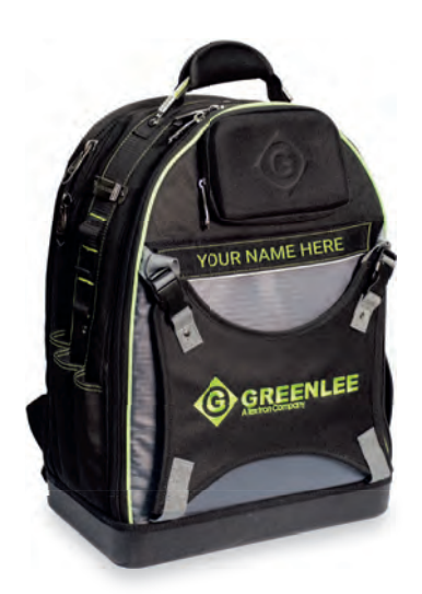
PROFESSIONAL TOOL BACKPACK*