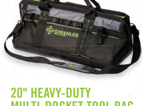
MULTI-POCKET TOOL BAG