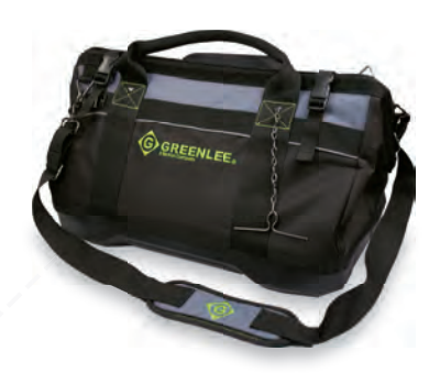
18" HEAVY-DUTY MULTI-POCKET TOOL BAG