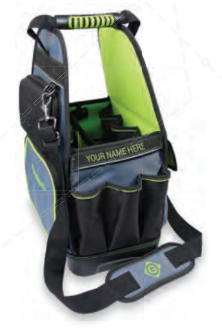
11" HEAVY-DUTY OPEN TOOL CARRIER*