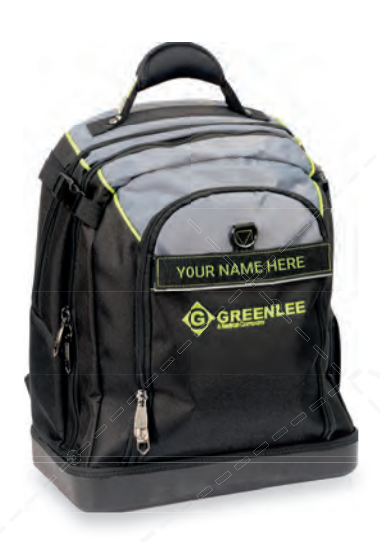
PROFESSIONAL TOOL & TECH BACKPACK*