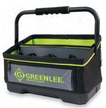
16" HEAVY-DUTY OPEN TOOL TOTE