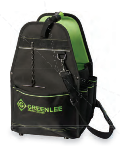
11" ELECTRICIAN'S OPEN TOOL CARRIER