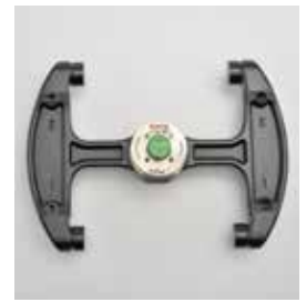
Image 1 - H-Flex Rotor Cross