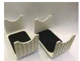
Image 8 - Microplate Adapter