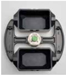
Image 2 - Rotor cross shown with buckets (rotor cross is sold separately, see below for selection)