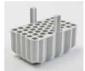
Image 7 - 5/7 mL Blood Collection Tube Adapter