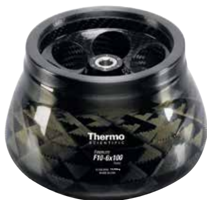
New Fiberlite F10-6x100 LEX Rotor