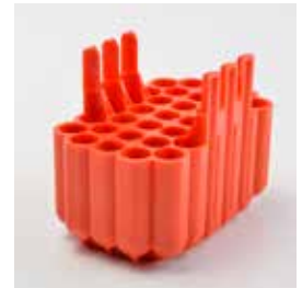
Image 6 - 5/7 mL Blood Collection Tube Adapter