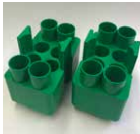
Image 4 - 50 mL Conical Tube Adapter