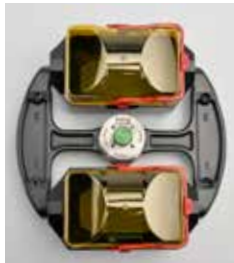
Image 3 - Rotor cross shown with buckets and with biocontainment lids (buckets and rotor cross sold separately, see below for selection)