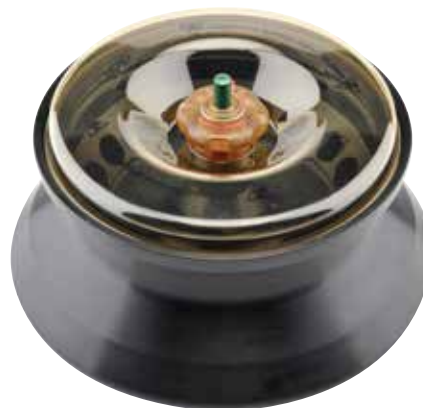
New MicroClick 18 x 5mL Rotor