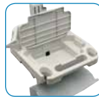
Additional storage provided to keep items out of sight

Notebook, keyboard and mouse not included.