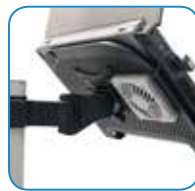
Cooling fan keeps notebook cool

Lightweight and durable construction equipped with 4" locking castors