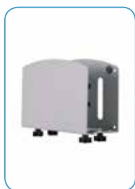
CPU Holder (Sold Separately, HCACC501 Shown, See Accessories)

Antimicrobial treatment inhibits the growth of bacteria, mold and fungus on the different touch points