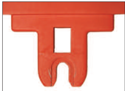
Hot Stick Connection: Shotgun or Universal Spline

The high voltage resistors limit the current through the ground cord to a maximum of less than one milliamp. Although the ground cords are insulated for voltage up to 20kV, they should always be kept free and clear from you and any other conductors.