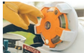
LO-OP Shown with optional equipment mount