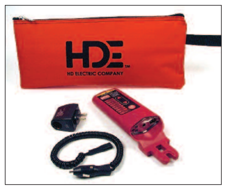
PRX-500/K03 Kit with Charge Cords & Bag