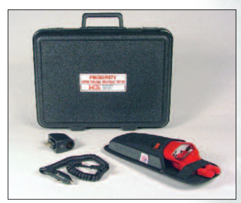
PRX-500 with Holster, Chargers & Case