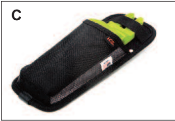
C. PRX-HS CARRYING HOLSTER Carrying holster with belt clip and restraining strap.