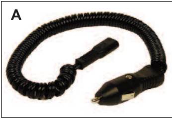
A. PRX-CORD CHARGE CORD Charge cord with 12VDC automotive jack.