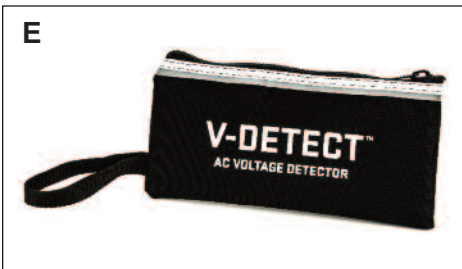
E. VDET-BAG CARRYING BAG Padded carrying bag with strap; holds V-DETECT Detector, PRX-HS, PT-VDET Tester and charge cords.