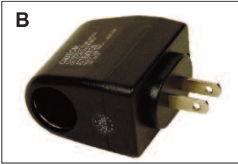
B. PRX-XF TRANSFORMER 115-240VAC transformer to plug PRX-CORD into 115-240VAC wall outlet.