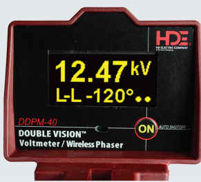
Phase Angle Display