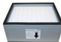
HEPA FILTER* P/N: A1573