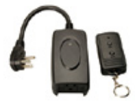
REMOTE POWER SWITCH* P/N: 999-252