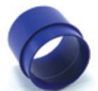
G) ADAPTER for neoprene duct P/N: B3621