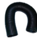
F) NEOPRENE DUCT P/N: 999-189