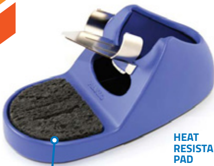
FX8804-CK IRON HOLDER CONVERSION KIT Includes everything shown in picture.