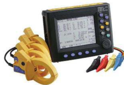
CLAMP-ON POWER HiTESTER 3169 CLAMP-ON SENSOR 9661