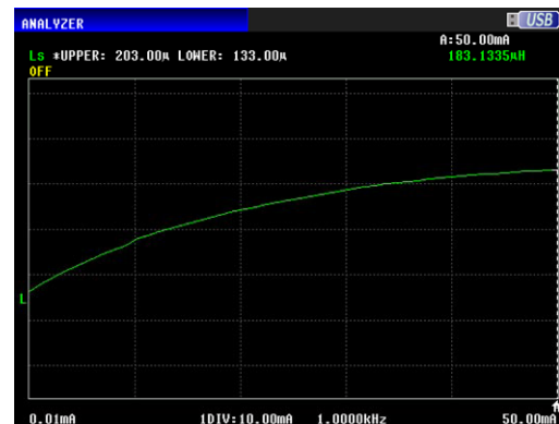
Measurement example of current characteristics (Analyzer mode)