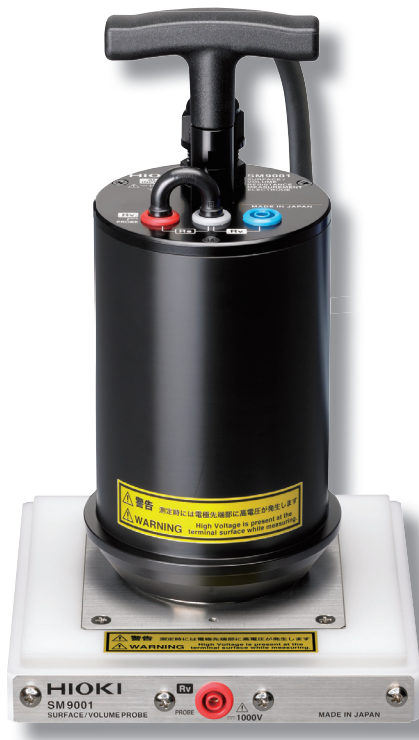
Fig. 1: SURFACE/VOLUME RESISTANCE MEASUREMENT ELECTRODE SM9001 (With integrated low resistance [500 k \Omega ]/high resistance [1 T \Omega ] test surfaces)

conditioned at least 24 hours at 23°C and 50% relative humidity and also tested in the same ambient conditions. A direct 500 V will be applied for 65 seconds between 2 electrodes. The surface resistance will then be measured. The typical value of the surface resistance is between 10 6 to 10 12 \Omega . A high surface resistance value indicates that the material is more insulative.