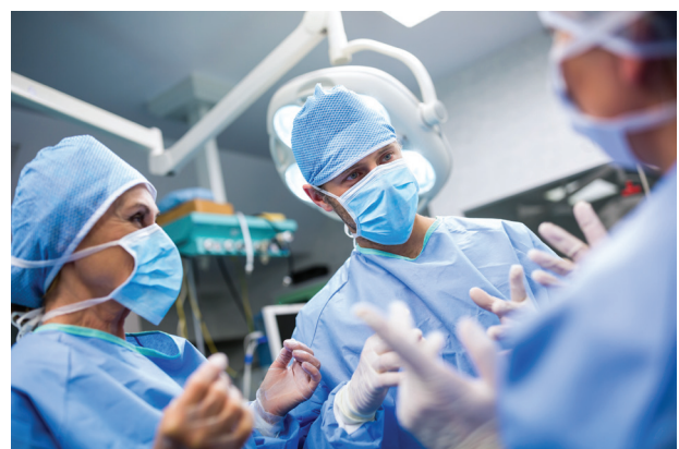
Critical environments such as hospital operating theaters require stringent static control

According to the IEC standards, equipment that contains non-metallic materials as enclosures is required to have its surface resistance tested. The test is conducted on parts of the enclosure or a test piece in accordance to the specified dimensions. The test object has to be