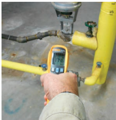
Viewing the temperature of the condensate line from a steam trap, to make sure it is functioning properly.

Steam trap failure can waste energy and cause improper HVAC system operation, resulting in a system freeze-up. With the Fluke 62 MAX+ IR Thermometer you can quickly identify a steam trap that has failed either open or closed.