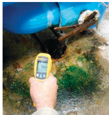
Taking the temperature of condensate as it goes into the drain.

Another use of the Fluke 62 MAX+ IR Thermometer is to check the actual coil temperatures of refrigeration system evaporators and condensers. These temperatures indicate proper system operation and efficiency. Improper coil temperatures can help identify problems while they are small and easily correctable.