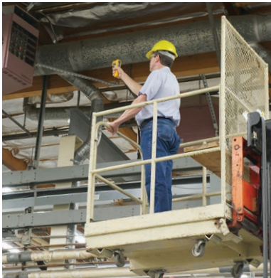
Identifying the temperature of ceiling-mount equipment.

A large amount of HVAC equipment is mounted above the floor in hard to reach areas, which can cause a safety hazard. You can use the Fluke 62 MAX+ IR Thermometer to easily check the temperature without exposing yourself to any safety issues.