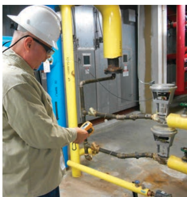
Testing the steam trap to see whether the trap has failed open and is wasting steam.