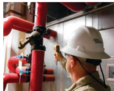
Looking at the water temperature at the inlet to an air handling unit coil.

Almost all commercial air handling units provide a low temperature limit switch. To prevent the freeze-up of a water coil, the low temperature limit will stop the supply fan. In some cases the low temperature limit may be adjusted incorrectly. You can use the Fluke 62 MAX+ IR Thermometer to check the calibration of the low temperature limit and adjust as needed.