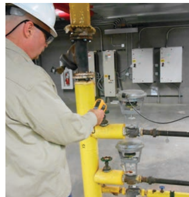
Measuring the steam temperature at the inlet to the humidifier valve.

properly. This increases safety because you do not need to touch the humidifier.