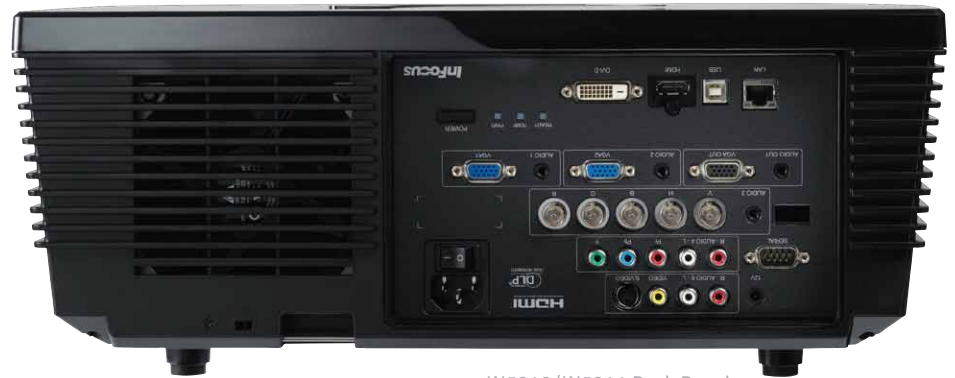
IN5312/IN5314 Back Panel

The 4000 lumens of the IN5314, IN5316HD and IN5318 display crisp, detailed images even in bright rooms. But if even more brightness is needed, you can bump it up to 4500 lumens with the IN5312. Plus, their single-lamp design makes it economical and easy to maintain.