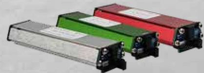
From left to right: refrigerant sensor 724-701-G1, CO 2 sensor 724-701-G2, and flammable refrigerant sensor 724-701-G3.