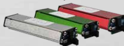
From left to right: refrigerant sensor 724-701-G1, CO 2 sensor 724-701-G2, and flammable refrigerant sensor 724-701-G3.