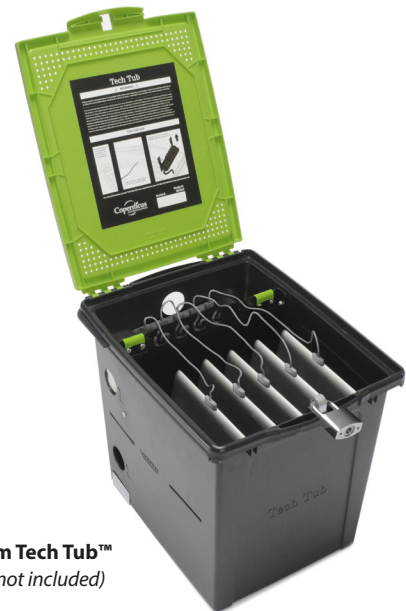
Premium Tech Tub™ (devices not included)

The inclusion of the Premium Tech Tub™ option ensures that class-room technology can be safely stored away and accessed efficiently.