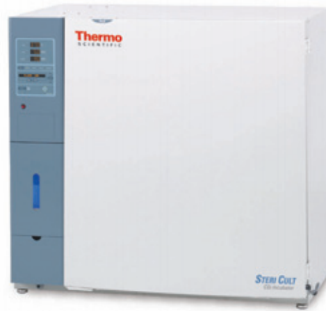
figure 1–Steri-Cult CO 2 Incubator with Class 100 Air

Class 100 air is achieved and maintained within the Series II Water Jacketed, Steri-Cycle, Steri-Cult, and Steri-Cult R CO 2 Incubators by way of our advanced incubator design and HEPA Filter Airflow System.*