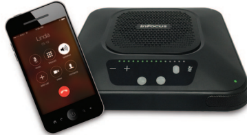
Mobile phone via Bluetooth