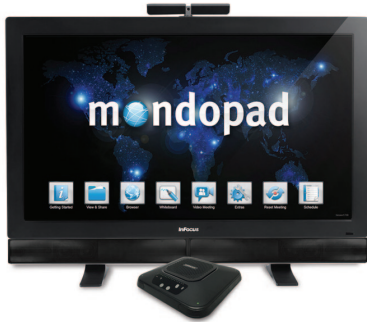
Mondopad via Bluetooth or USB

Use Thunder with the InFocus Mondopad for clear, efficient videoconferences in small-to-medium sized rooms, or in larger rooms with the optional Mic Pods. You can also use it with any other PC-based communication software (such as Skype, Lync, Jabber, etc.) to enhance audio quality and comfort. Its Bluetooth connectivity makes it easy to use with mobile devices.