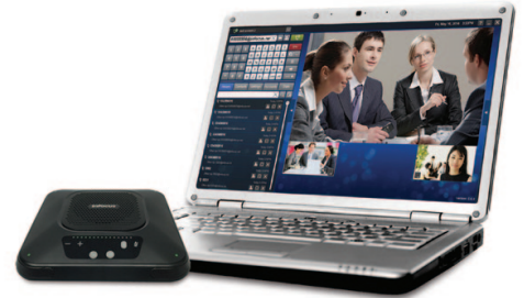
PCs via Bluetooth or USB