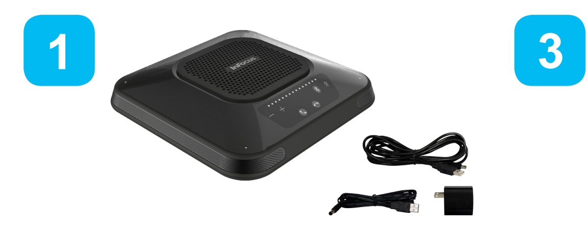
*Regional adapters included, but not shown.