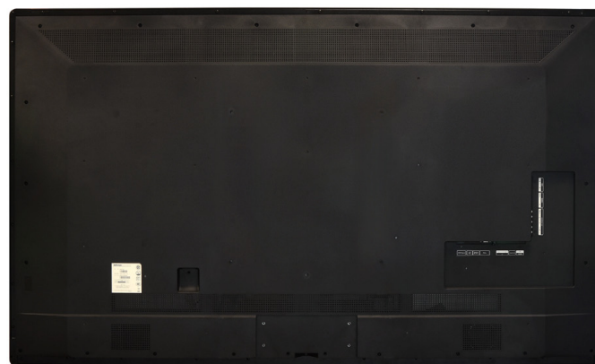
INF7001 back panel

©2014 InFocus Corporation. All rights reserved. Specifications are subject to change without further notice. InFocus, InFocus The New Way to Collaborate and JTouch are either trademarks or registered trademarks of InFocus Corporation in the United States and other countries. All trademarks are used with permission or are for identification purposes only and are the property of their respective companies. InFocus-JTouch-2page-Datasheet-EN-28FEB14.