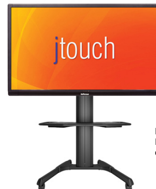
INF7001 on optional Pro Mobile Cart with optional Accessory Shelf

Secure the JTouch to the wall with its standard VESA mounting pattern or mount it on an optional InFocus mobile cart. A mobile cart lets you position it in multiple locations within a room or share it between multiple rooms — wherever it's needed most.