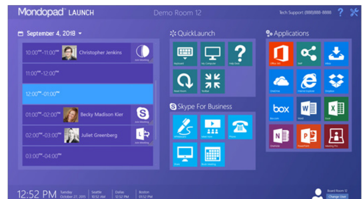
QuickLaunch Professional Edition

Montage, from DisplayNote, offers simple but powerful casting so that you can easily share content wirelessly from your laptop or mobile device. Montage allows up to six people to cast content simultaneously. The main user at the screen can choose which user to show as the active screen, and other users can then annotate from their personal device on to the casted image for all to see.