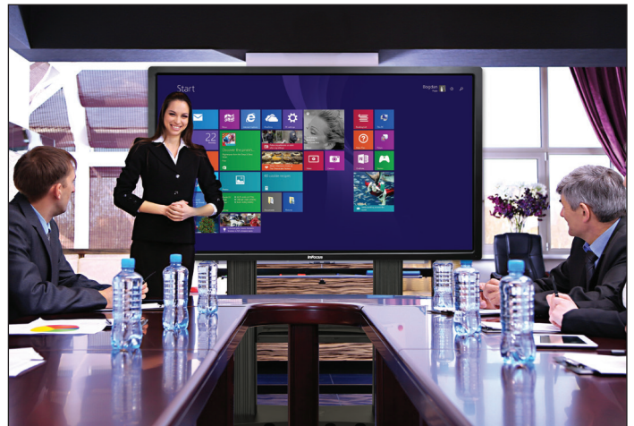
80" BigTouch (INF8012)