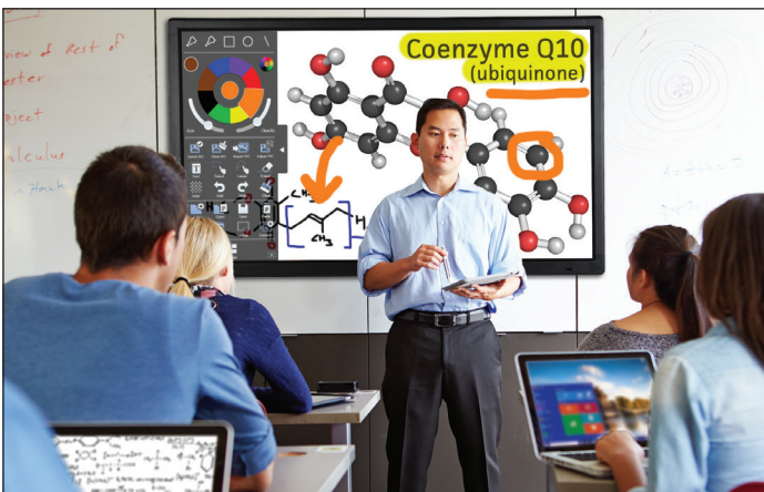
65" JTouch Whiteboard with LightCast (INF6501c/INF6501cp)