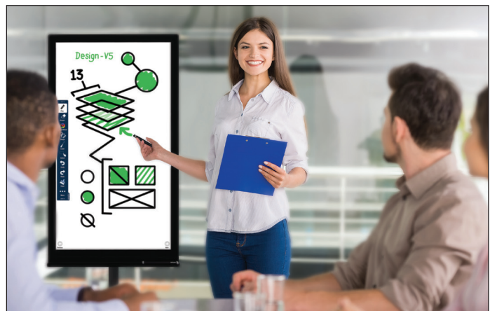
40" DigiEasel (INF4030/INF4030p)