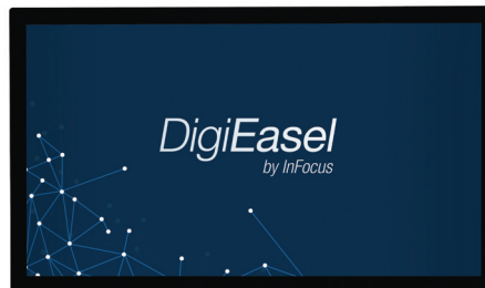
DigiEasel works in either portrait or landscape mode.

* Check with your manufacturer for Miracast or AirPlay compatibility with the specific version of your device's OS.