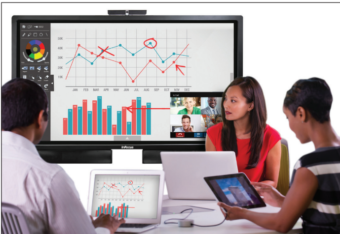
70" Mondopad (INF7021)