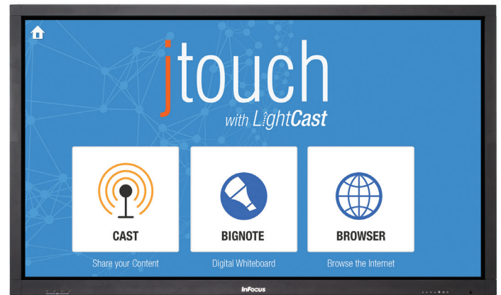
65" JTouch Whiteboard with LightCast (INF6501c/INF6501cp)