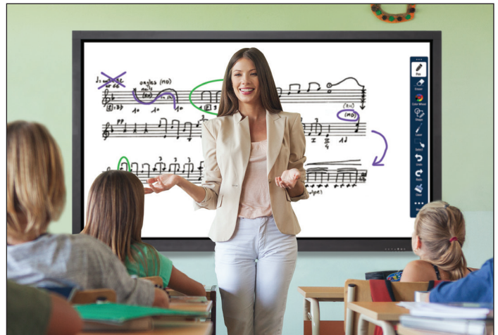
80" JTouch (INF8002)