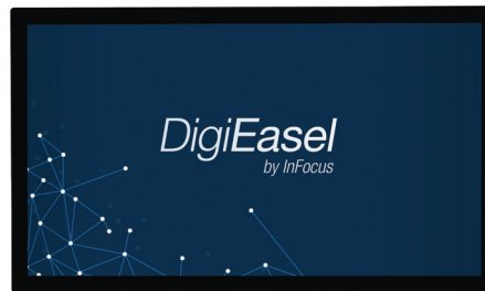
DigiEasel works in either portrait or landscape mode.