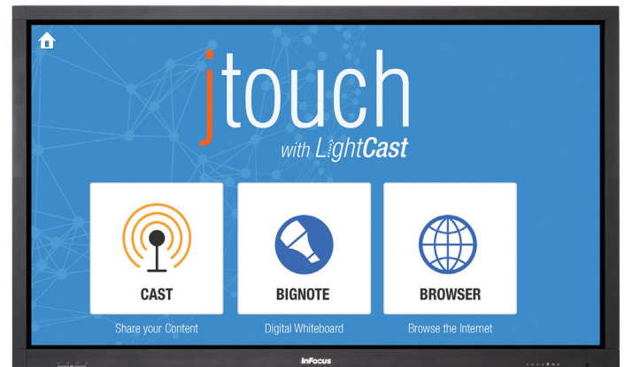
65" JTouch Whiteboard with LightCast (INF6501CB/INF6501CBp)