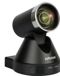
RealCam PTZ Camera

Thunder Speakerphone (INA-TH150): VoiceAware anti-echo & noise-reducing technology for any size meeting room