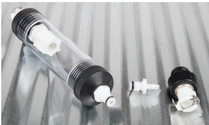
18109605 Benzene Tube Holder, Quick Connect