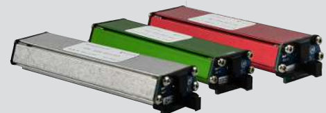
From left to right: refrigerant sensor 724-701-G1, CO 2 sensor 724-701-G2, and flammable refrigerant sensor 724-701-G3.