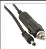
CAR POWER CORD