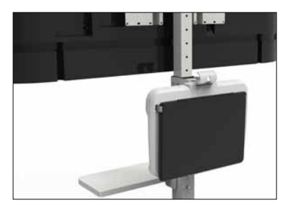
Back view with laptop tray stowed (IFP600)