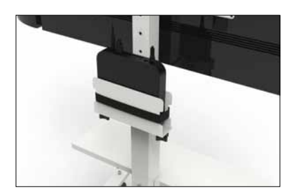
Mini PC Mount (IFP650)