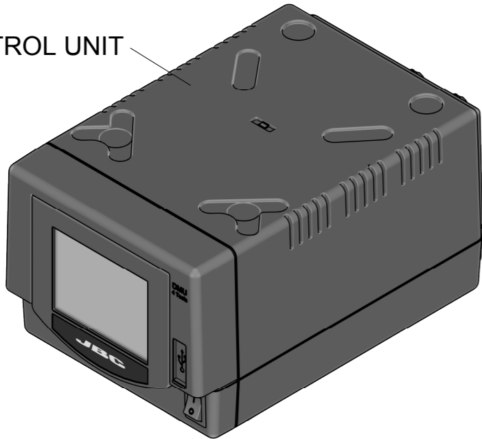
DMU CONTROL UNIT