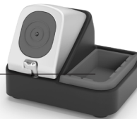
CLM Manual Tip Cleaner