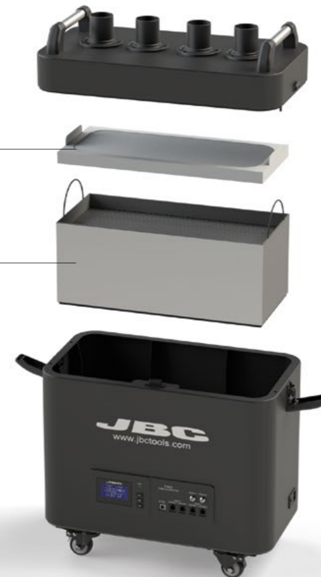
FAE2100 Filter for FAE2