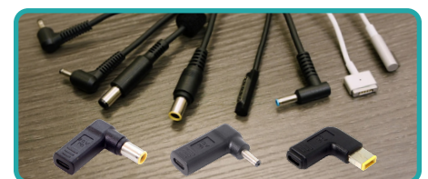
Emulator Adapter Cables

65W output max per USB-C port 500W output max per hub Overcurrent, overvoltage protection