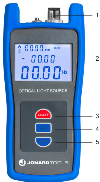
Diagram of the FLS-55