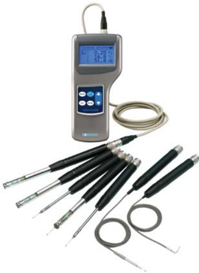
Climomaster shown with all the available probes

We're always happy to hear from you and help you find the right solution for your problem.