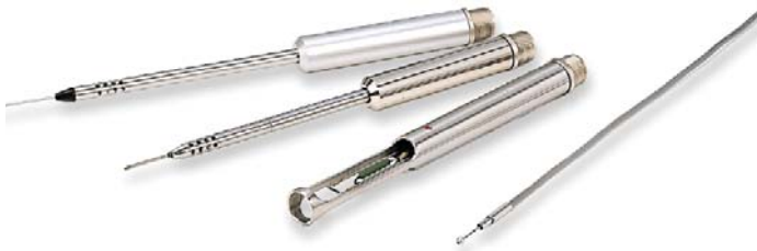
Four common types of hot-wire probes

Kanomax has extensive experience creating hot-wire anemometers to measure airflow in a wide variety of circumstances. In fact, the number of options we've added to our catalog over the years can be bewildering to new customers or to someone suddenly assigned to a project that requires accurate measurement of airflow. Sometimes even industry veterans don't fully understand the different options available to them. If either of the preceding two sentences sounds like it may apply to you don't worry! You're in the right place to get help understanding what the different options are and which is best for your application.