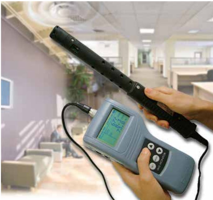
Model 2211 Handheld IAQ Monitor

When we think of indoor air quality many people think of controlling the temperature and eliminating toxins such as carbon monoxide, and it is true that these two parameters are important factors, but they are only part of IAQ. Humidity is large factor in how comfortable a building's occupants feel and can lead to complaints of it being too hot or cold, even when the temperature is set at the correct level. The comfort zone chart is a useful tool for determining acceptable levels for humidity and temperature based on the season.