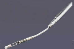
Telescopic, articulating probe