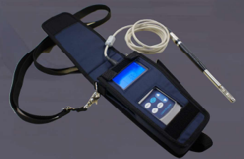
Hands-free Case now available!