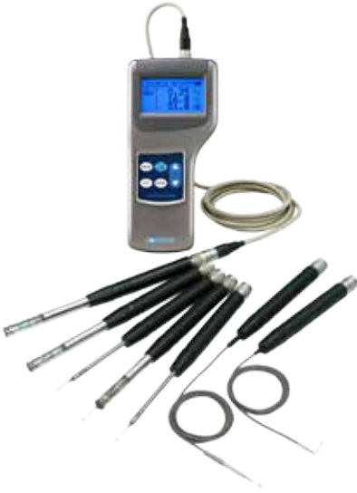
Climomaster shown with all the available probes

If you're still not sure which probe is right for you, give us a call at 973-786-6386 or send us an email at info@kanomax-usa.com and we'll be happy to help you find the right probe for your application. We're always happy to hear from you and help you find the right solution for your problem.