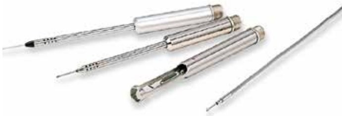
Four common types of hot-wire probes

The second type of probe we developed was similar, but had the capability to detect airflow in a 360° circle around the probe. Physically this probe resembles a needle attached to a metal rod, and is in fact often called a needle-type probe. With a round needle-shape sensor it's no longer necessary to keep the probe perpendicular to the direction of the airflow,