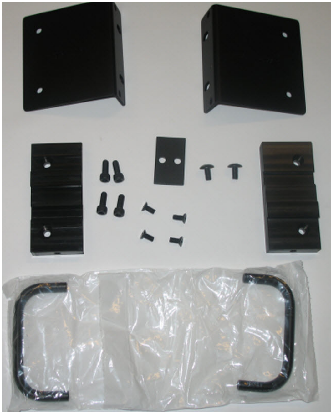
Figure 3: Model 2290-10 rack mount kit hardware

The next figure shows the hardware that you will receive with your rack mount kit. You can use this figure, the Parts list (on page 1), and the previous figures to ensure that you have all of the necessary hardware to mount your instruments.