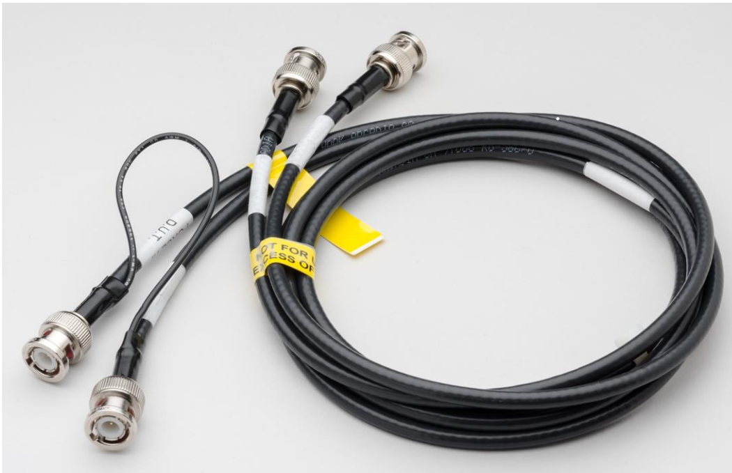
Figure 1: 2601B-PULSE-CA1 Cable Kit FORCE cables

This cable kit is intended for use with the Model 2601B-PULSE System SourceMeter® instrument with the 2601B-P-INT Interlock and Cable Connector Box installed.