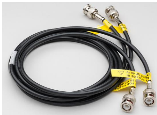
Figure 1: Model 2601B-PULSE-CA2 Coaxial Cables

These cables are intended for use with the Model 2601B-PULSE System SourceMeter® instrument with the 2601B-P-INT Interlock and Cable Connector Box installed.