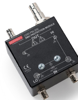
The 2290-PM-200 Protection Module protects low voltage measurement equipment from voltages greater than 200V.

Series 2290 Power Supplies and a 2290-PM-200 SMU Protection Module protect both user and instrumentation from hazardous voltages. An interlock circuit built into the power supplies can be used to ensure that the output voltage is disabled if a high voltage test fixture access door is open. In addition, all Series 2290 power supplies have low voltage analog outputs to permit safe monitoring of the high voltage and the output current.