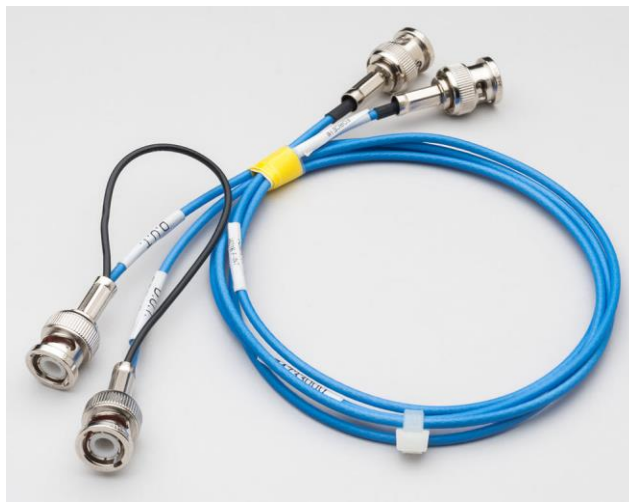
Figure 1: Model 2601B-PULSE-CA3 Cable Kit

This cable kit is intended for use with the Model 2601B-PULSE System SourceMeter® instrument with the 2601B-P-INT Interlock and Cable Connector Box installed.