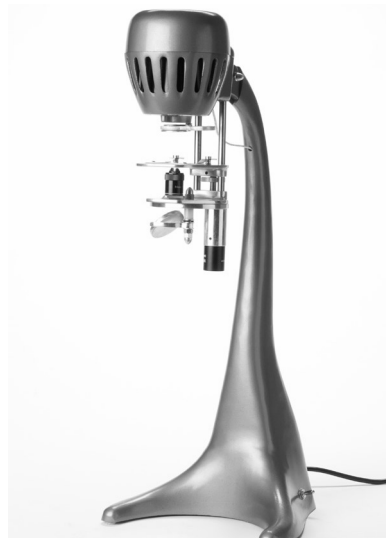
Figure 1. Position for Horizontal Projection