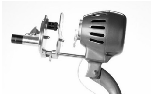
Figure 2. Position of Head for Screen Projection