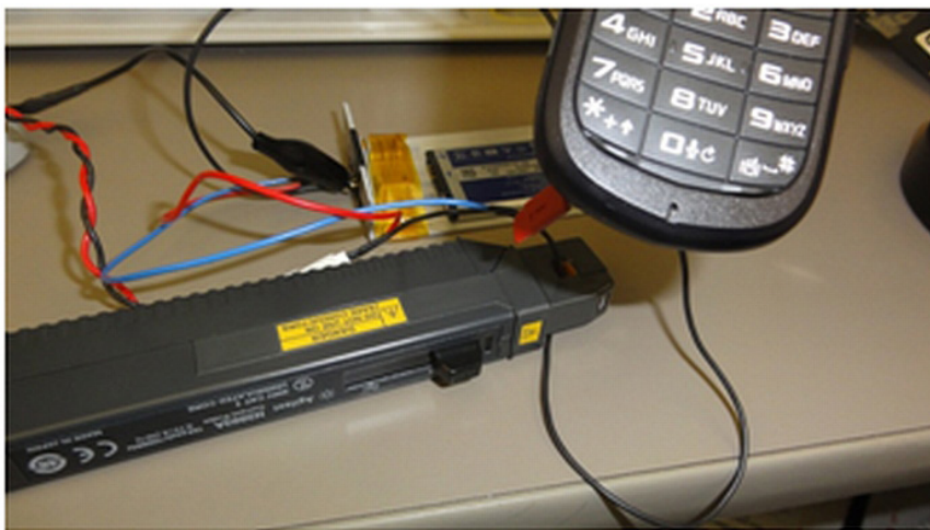
Figure 2 A simple way to measure a current with an oscilloscope is to use a clamp-on type current probe such as Keysight's 1147B or N2893A.

Also, for a more accurate measurement, one would occasionally degauss the probe to remove residual magnetism from the probe core and compensate for any DC offset of the clamp-on current probe. This extra calibration procedure makes the clamp-on current probe cumbersome to use.