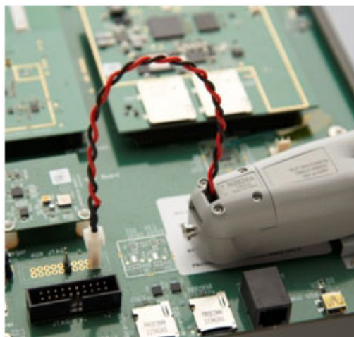
Figure 4 The supplied Make-Before-Break (MBB) connectors allow you to quickly probe multiple locations on your DUT without having to solder or unsolder the leads.

The probe offers an innovative method of connecting the probe to your DUT. The supplied Make-Before-Break (MBB) connectors allow you to quickly probe multiple locations on your DUT without having to solder or unsolder the leads. The MBB header may be mounted on your target board or wired out of the DUT. It fits into standard 0.1" spacing thru-holes for 0.025" square pins. Users should plan their PCB layouts accordingly. The MBBs are a great way to easily connect and disconnect across multiple locations on the target board without interrupting the circuit under test.