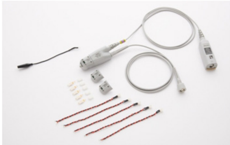
Figure 3 The new N2820A/21A AC/DC current probes offer the industry's highest sensitivity among oscilloscope current probes.

Keysight's N2820A 2-channel high sensitivity current probe comes with two parallel differential amplifiers inside the probe with different gain settings, where the low gain side allows you to see the entire waveform or the "zoom out" view of the waveform and the high gain amplifier provides a "zoom in" view to observe extremely small current fluctuations, such as a mobile phone's idle state. The N2820A/21A current probes are optimized for measuring the current flow within the DUT to characterize sub-circuits, allowing the user to see both large signals and details on fast and wide-dynamic current waveforms.