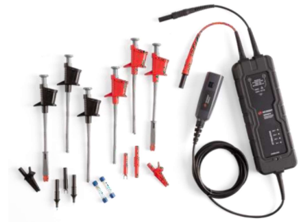
DP0001A high voltage differential probe

The DP0001A is a 400 MHz high voltage differential probe with 2 kV mains isolated or 1 kV CAT III rating designed for making accurate high-voltage power measurements required for testing today's WBG power devices, power converters or motor drives. Thanks to high bandwidth and low loading characteristics, the probe can accurately measure 1 kV transient pulse with as fast as 1.2 nsec of edge speed in modern switching power supplies. Also, high CMRR simplifies the measurement challenges found in noisy, high common-mode power electronics environments.