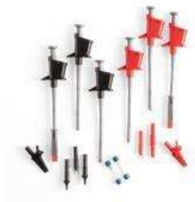
DP0002A Accessory kit for DP0001A