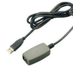
U1173A IR-to-USB cable