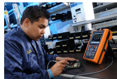
Figure 1. Indoor viewing mode